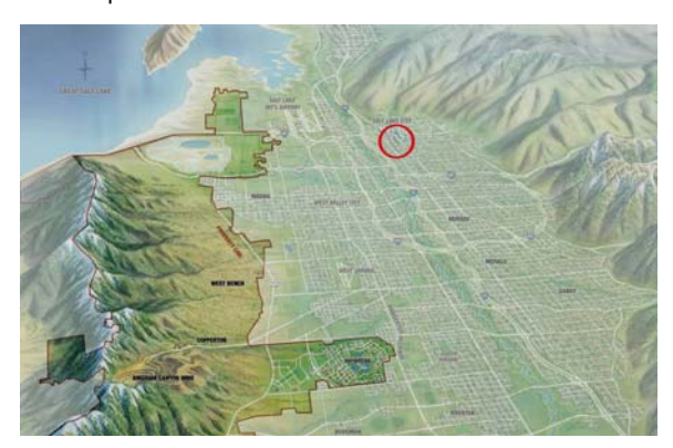
Figure 1: Map of the Salt Lake valley. The red circle indicates the location of Salt Lake City. The outlined area in bold on the West Bench of the valley indicates the land owned by Kennecott.

Suburban Redux was an elective spring 2006 housing studio that has fostered collaboration between graduate students of architecture at the University of Utah and Kennecott Land, a sustainable developer, and its home builders to produce architectural prototypical designs for market rate housing at current and future sustainable developments in Utah. collaboration has provided a forum for builders and students to discuss and learn more concerning their respective roles in designing and building sustainable residences and communities, while providing timely research for the developer in sustainable housing. The experience has most importantly fostered a beginning to a long-term research-based collaboration between the university and the developer.