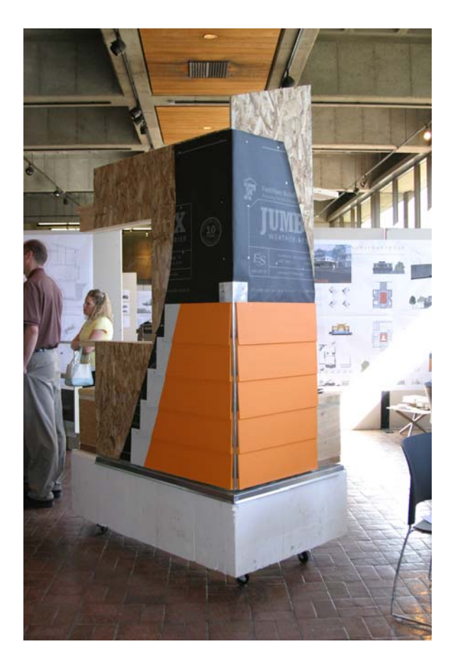
Figure 7: Students Ryan Berry and Adam Naylor construct a prototype corner of their design proposal which implements Insulated Concrete Foundation (ICF), panelized walls utilizing 2 x 6 @ 24" o.c. efficient framing, and cement board siding.